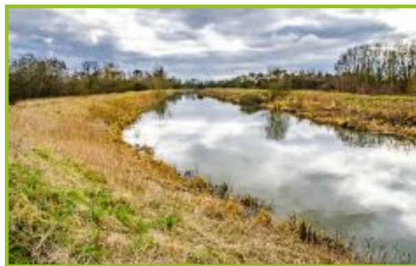
Hall fishing ponds, a relic from the time when Bracebridge Hall stood in extensive grounds.

Follow this grass track ahead for some distance, later with a fine view of Lincoln Cathedral on the horizon ahead. Eventually you will come to a path junction (with fingerposts visible to your left and right). Turn left to cross the ditch and then turn immediately right through a kissing gate to enter a paddock (which may be holding horses). As you walk into this paddock, you will notice the drainage ditch (now on your right) merges at this point with the River Witham.